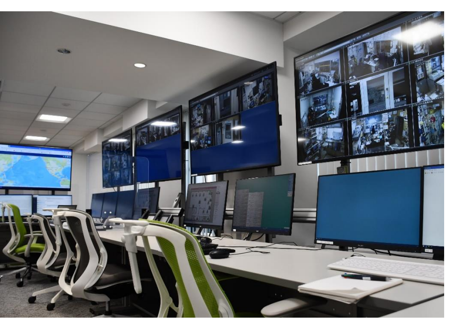
Kanto Regional Office CSC

Accelerated the development of "area management", a new facility management model, to build a sustainable business model