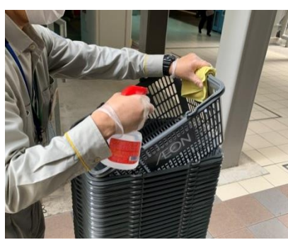
Preventative cleaning with alcohol