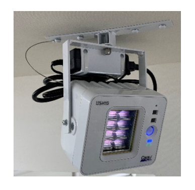
Antivirus and sterilizing UV irradiation system

such as tables, chairs and other fixtures and vending machines.