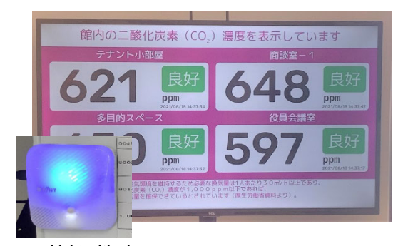
Light with alarm CO2 concentration in the room can be confirmed on the monitor

● Performing ventilation according to CO<sub>2</sub> concentration An open network system is introduced to continuously monitor CO<sub>2</sub> concentration in the room using CO<sub>2</sub> sensors and to automatically adjust ventilation volume depending on the situation, while the operation of each air conditioner unit is centrally controlled, and air volume and temperature settings are automatically adjusted according to the air environment. The CO<sub>2</sub> concentration, temperature and humidity for each location are displayed