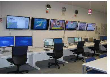
(Photo top left) Kanto Regional Office CSC assigned with the backup function of ADSC. (Photo top right) ADSC Osaka (Photo bottom left) ADSC Komaki

Since the Great East Japan Earthquake, AEON Group has carried out disaster prevention measures in various parts of Japan including disaster-affected areas based on its Business Continuity Plan (BCP). In the meantime, the importance of Business Continuity Management (BCM) that manages the implementation of BCP has increased due to diversification in the types of possible risks, such as more natural disasters including earthquakes and torrential rain caused by abnormal weather, besides terrorist incidents and explosion accidents. In response to this situation, AEON Group is promoting BCM with focus on five areas, "Information infrastructure upgrades," "Improved measures for facility safety and security," "Enhanced supply chains for products and logistics," "Training and drills to improve business continuity," and "Greater, more systematic collaboration with external organizations," and has establish the PDCA cycle starting with BCP at an early stage. Of the five focus areas for BCM, the Company is mainly responsible for "Improved measures for facility safety and security."